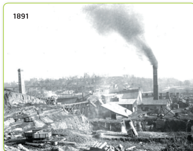
Figure 3.21 Ecological restoration has converted Toronto's Don Valley Brick Works (shown in 1891 and today) into a natural environment and cultural heritage park that includes wetlands, a boardwalk, a wildflower meadow, and restored historic buildings.

Inquiry Investigation 3-B, Balancing Populations and the Environment, on pages 118-120