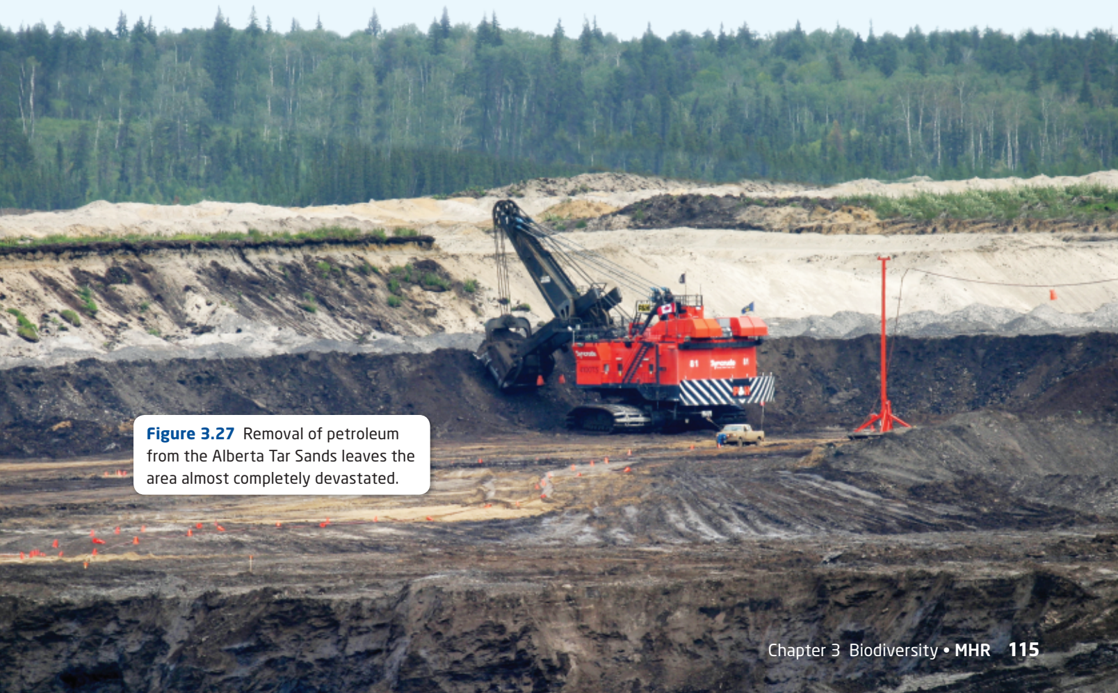
Figure 3.27 Removal of petroleum from the Alberta Tar Sands leaves the area almost completely devastated.

bioremediation the use of living organisms to clean up contaminated areas naturally bioaugmentation the use of organisms to add essential nutrients to depleted soils