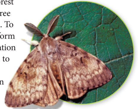
Figure 3.24 Gypsy moths can eat all the leaves on a tree.

biocontrol the use of a species to control the population growth or spread of an undesirable species