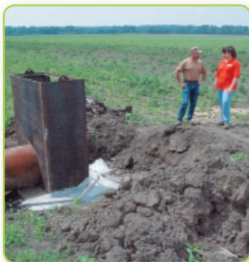
Figure 3.23 Water control structures are used by wetland conservationists to help restore and maintain water levels.