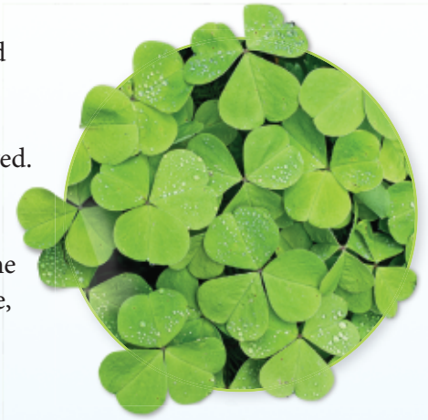
Figure 3.26 Clover is often planted to replenish nitrogen levels in soil.

Bioaugmentation is another restoration tool. Bioaugmentation is the use of organisms to add essential nutrients to depleted soil. For example, the clover shown in Figure 3.26 is often planted to replenish nitrogen levels in soil. Recall that nitrogen is an important nutrient for plants.