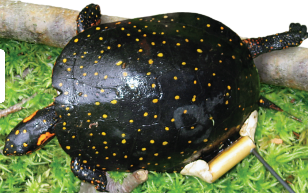
Figure 3.20 The radio transmitter on this spotted turtle, a rare species in Ontario, helps biologists learn more about its life history.

Just as rivets hold an airplane wing together, species hold ecosystems together. There are some special “rivets” that ecosystems cannot afford to lose, such as the keystone species you read about in Section 3.2. However, ecosystems tend to be over-engineered with lots of rivets too, especially rivets with high biodiversity. Most ecosystems might remain sustainable with the loss of one or two rivets, but as more rivets are lost, the ecosystems will lose their ability to sustain the remaining species, including humans.