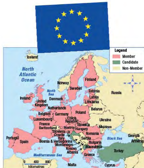
Countries in the European Union, 2008

9. According to the map, which of the following countries are members of the European Union?