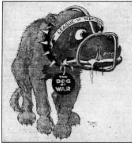
MUSSELED? —London Opinion.