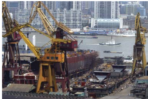
Large shipbuilding yard in Shanghai, China