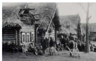
Russian village, 1890s

Use the following photographs to answer question 8.